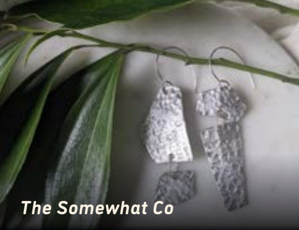
The Somewhat Co