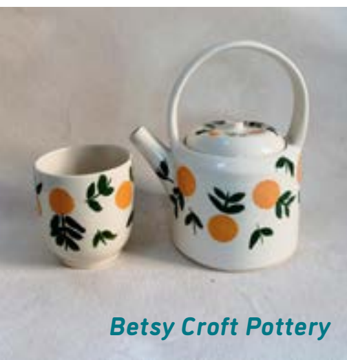
Betsy Croft Pottery